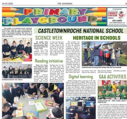
Table Quizzes, Creative Writing, Speech & Drama and Art to name but a few.